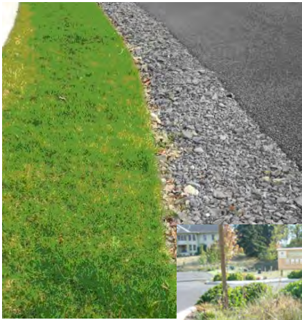
Figure 3: Curbless swale zone with gravel verge