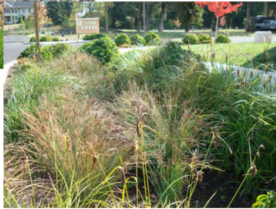
Right— Figure 4: Rain Garden

Environmental Consultants. Pringle Creek Community’s predevelopment subsoil infiltration rates were between 2 inches and 11 inches in a 24 hour period. The streets are designed to accommodate a rainfall of 1 inch per 24 hour period. The Salem area receives an estimated 40 inches of precipitation annually.