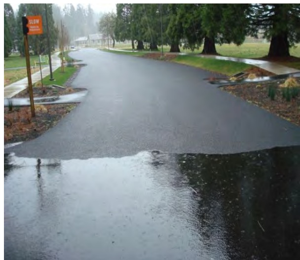
Figure 5: At the entrance to Pringle Creek Community: Permeable vs. Impermeable Asphalt

A second benefit of porous pavement is the ability of the water to soak through the pavement during a heavy rain, as opposed to high volumes of runoff causing the storm sewers to back up and flood the streets. In figure 5, one can observe the difference between permeable (background) and traditional