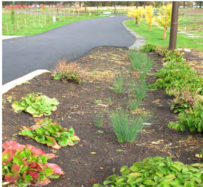
Figure 1: Green streets at Pringle Creek feature pervious asphalt and grassy swales, plus rain gardens at every intersection.

Traditional road-building practices focus on ways to most efficiently move water away from the road.