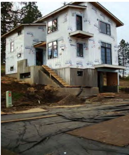
Figure 6: Geotec Fabric on the permeable pavement for protection during home construction.

Currently, Pringle Creek Community is not conducting any formalized analysis of the effectiveness of the green street design, but is interested