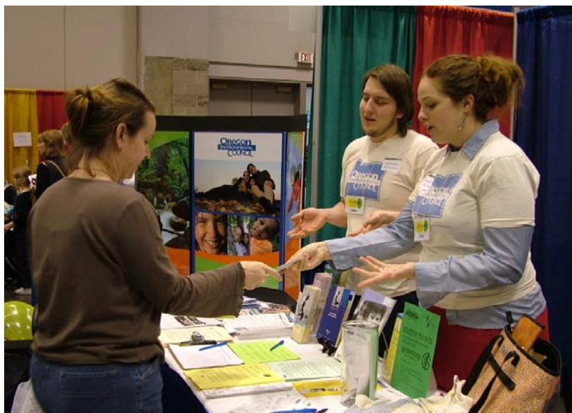
OEC volunteers chat with a mom at KidFest in Portland, which was held in March.