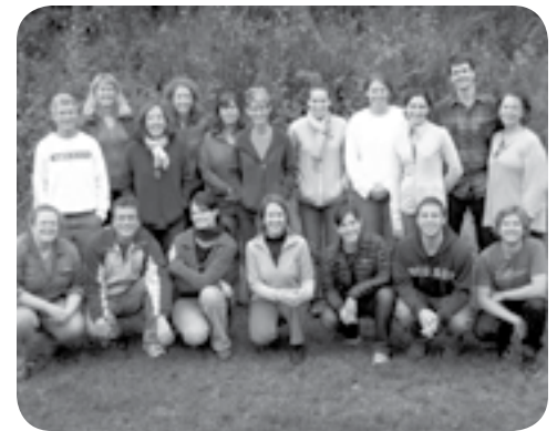
OEC staff during annual retreat at L.L. Stub Stewart State Park.

Curveballs are a fact of life. But when it comes to protecting our environment, OEC will do whatever it takes to make this a place that is healthier for our children and grandchildren. That's the kind of mark we're happy to leave on Oregon's landscape.