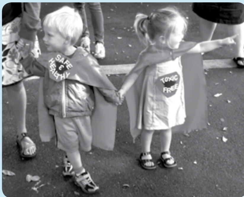
Oregon families joined together earlier this year in "stroller brigades" to support the regulation of toxic chemicals in everyday products.

The standing-room-only hearing room that day was filled with parents, kids, health experts, community leaders and others who believe strongly in protecting the health of all Oregonians from toxic chemicals. They were rewarded with a unanimous vote in favor of a county-wide BPA ban. It's a small victory against one in a large number of hazardous chemicals—but it shows that Oregon's elected officials can, and will, act to protect people when federal regulations fail and when compelled by enough voices. With the power of outspoken Oregonians on our side, OEC will keep working to reduce toxic exposures and promote the use of safer, green alternatives all across Oregon.