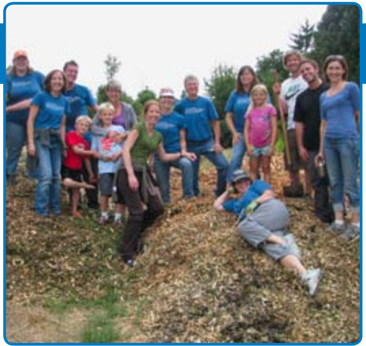
Johnson Creek Service Day, 2011

The Oregon Environmental Council safeguards what Oregonians love about Oregon—clean air and water, an unpolluted landscape, and healthy food produced by local farmers. For more than 40 years we've been a champion for solutions to protect the health of every Oregonian and the health of the place we call home. We work to create innovative change on three levels: we help individuals live green; we help businesses, farmers and health providers thrive with sustainable practices; and we help elected officials create practical policy. Our vision for Oregon includes solving global warming, protecting kids from toxics, cleaning up our rivers, building sustainable economies, and ensuring healthy food and local farms. For more information on our vision, how we measure our success, and strategies we use to achieve our goals, see our 2002-2012 Strategic Plan .