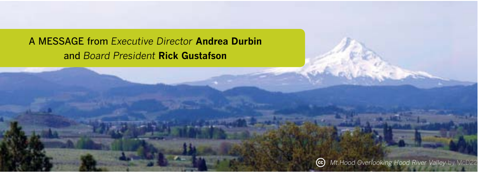
© Mt.Hood Overlooking Hood River Valley by McD22

For more than 40 years, Oregon Environmental Council has fought to protect our most vital natural resources: clean air and water, an unpolluted landscape, and healthy food produced by local farmers.