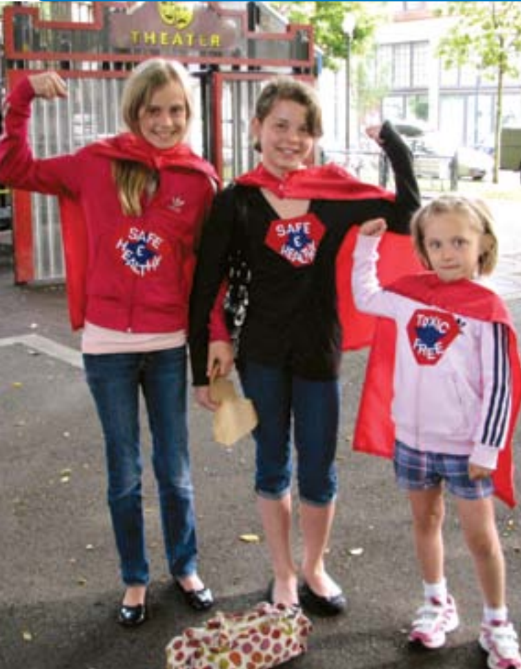
Super Kids Brigade for safer chemicals